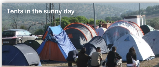
Tents in the sunny day

Last april I went to teach on a 9 months youth training program in the north of Spain. "La industria" (The training program's name) has a goal to train and raise a new generation of leaders for the kingdom. All the students are musicians and have been practicing a lot every day (about 5 hours). The subject given to me to teach was about "my lifestyle first than music". Many musicians has their eyes on the performance but the Lord wants much more than that, He wants our lives .It was great to see them dedicating their time and life to get prepared to serve the Lord in a better way (not only in excellence playing but also in holiness). We praise God for the youth that follow Him and know His will.